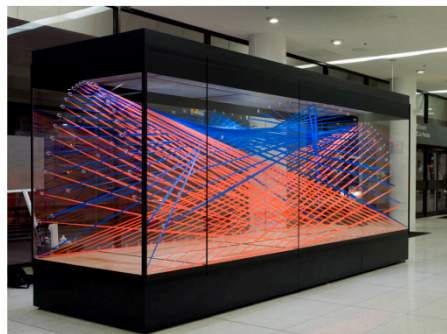
"Twisted under, sideways down", on display at LAX Airport until July 22, 2010 in Terminal 3, Lower/Baggage Level