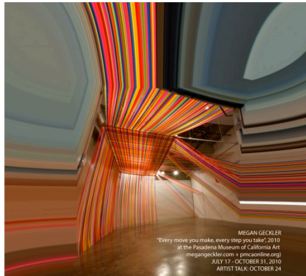
MEGAN GECKLER "Every move you make, every step you take", 2010 at the Pasadena Museum of California Art megan.geckler.com + pmcaonline.org JULY 17 - OCTOBER 31, 2010 ARTIST TALK: OCTOBER 24