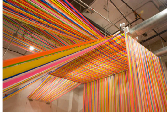
"Every step you take, every move you make," 2010, detail